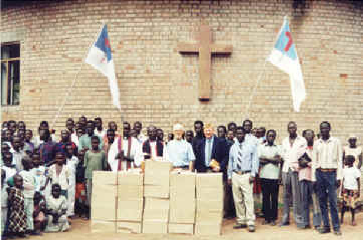
With much rejoicing Bish