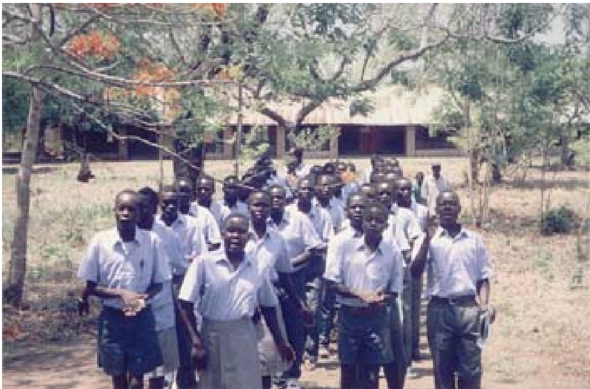
Students of the Christian Liberty High School at the

After the consecration service, visitors were treated to a celebration feast and a tour of the school buildings. The well stocked library was of special interest. Much still remained to be done but the school was in session and services, Bible studies, outreaches and medical ministry were being conducted everyday. Literally tonnes of Bibles and books have been distributed from the mission base month by month.