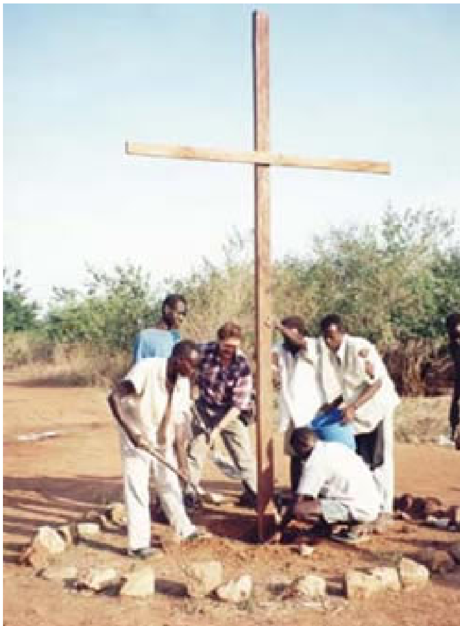
One of the crosses erected on the road to Christian Liberty High School in Sudan