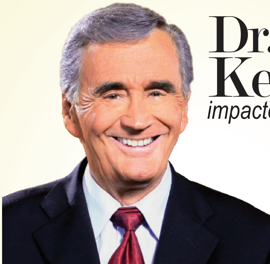
Dr. D. James Kennedy 1930 - 2007