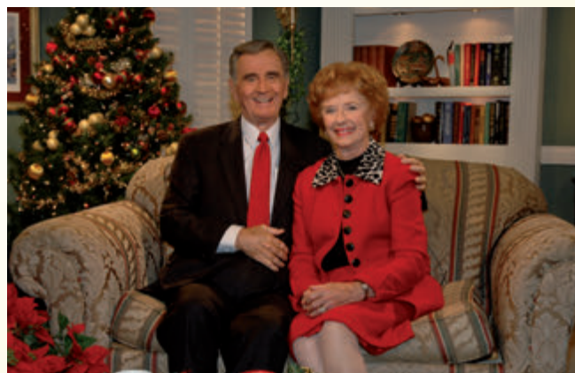
Dr. Kennedy and his wife, Anne

James Kennedy soon discovered that the answer was to surrender his life to Christ and to trust Him alone for forgiveness of sins and the gift of eternal life. Shortly after being converted to Christ, he was called into the ministry of the Gospel. He began his pastorate at Coral Ridge Presbyterian Church on 21 June 1959. He recalled that he soon had that group of 50 members down to 17. He was very discouraged about his call to the ministry when he received an invitation to conduct a series of Revival meetings in Decatur, Georgia. There he was trained in personal evangelism.