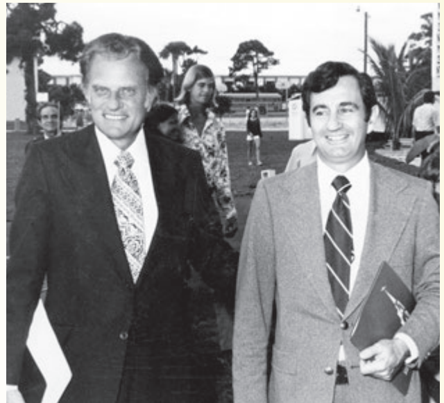
Rev. Billy Graham with Dr. James Kennedy at the Dedication service at Coral Ridge Presbyterian Church - 1974