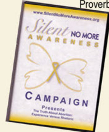
Silent No More Awareness Campaign - The Truth About Abortion: Experience vs Rhetoric DVD - R135