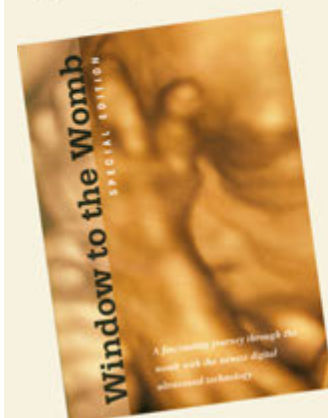
Window to the Womb DVD R368

FREE Leaflets in English, Afrikaans and Xhosa: