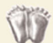
Precious Feet Lapel Pins: R15 each (silver or gold)